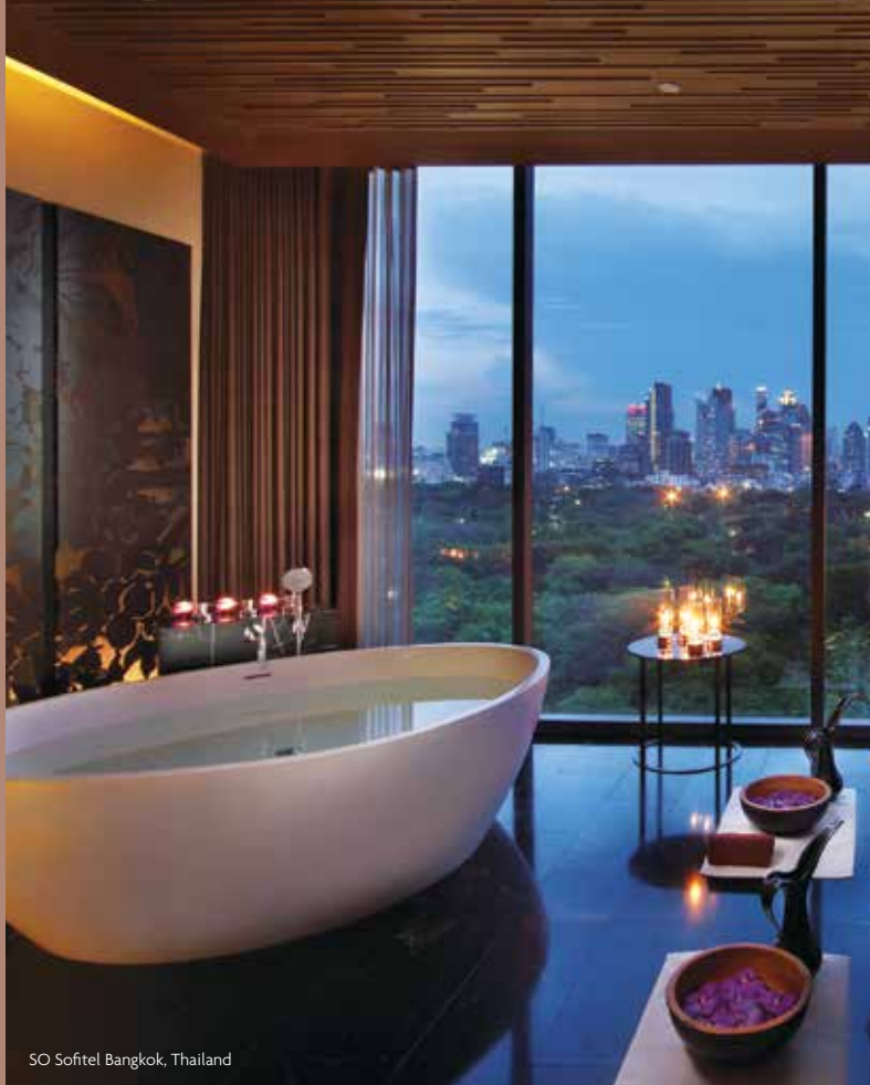
SO Sofitel Bangkok, Thailand