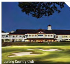
Jurong Country Club