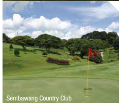
Sembawang Country Club