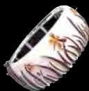
The Jewel Box