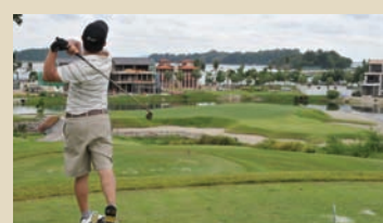
Teeing off with a scenic view

In the evening, participants were invited to the ballroom of Sentosa Golf Club where gastronomic delights and fine wine awaited. Artiste Allan Wu, who was the presenter for the evening, dazzled the participants with entertaining banter during the prize presentations. If the smiles on the faces of all were anything to go by, the event marked another infinitely successful networking session for clients and Relationship Managers.