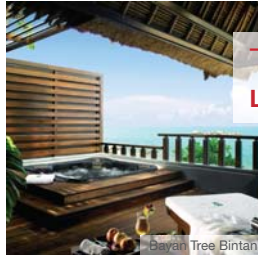
Banyan Tree Bintan

* Promotion valid till 31 May 2006. Thereafter, min retail spend of $1500 applies Terms and conditions apply. Visit www.uobgroup.com for more details