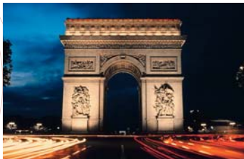
London and Paris