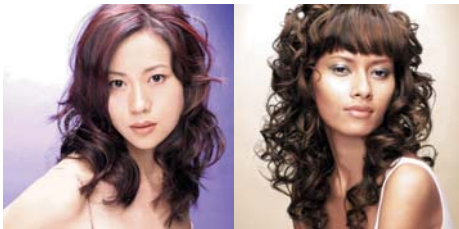
Mahogany HAIR ¥ BODY & SOUL

¥ Payment must be made with UOB Lady's Card