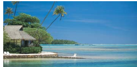
More Reasons to bring your UOB Tiger Airways Card overseas

¥ Price and availability are subject to changes at the time of booking