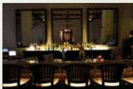
Quaruba'r Tel: 6479 9929

1-for-1 Coffee (complimentary coffee priced at equal/ lower than first drink)