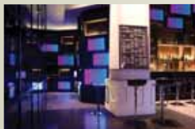
Angel's Share Tel: 6471 9595

1-for-1 glass of wine (first glass only, valid from Mon – Thur)